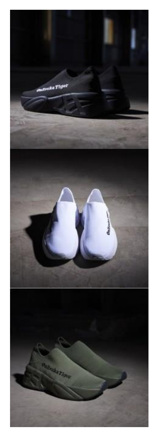
The P-TRAINER KNIT LO retails at RM599.