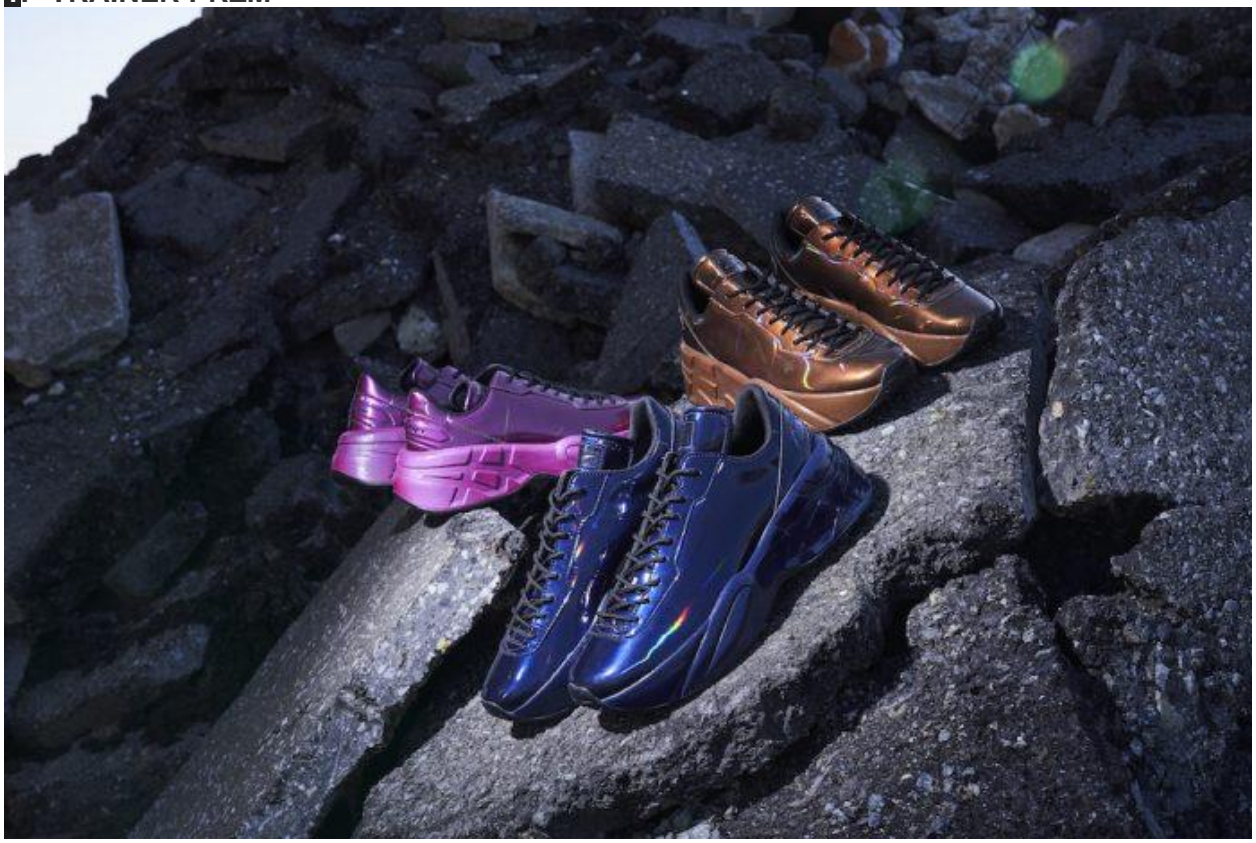
This P-TRAINER style has been given a facelift with the reworking of the silhouette to feature a bold design with monochromatic iridescent hues, along with a simplified upper and striking holographic effect to the sole finish. This model includes a FLYTEFOAM Propel midsole and OrthoLite inner sole that promises better cushioning and resilience.