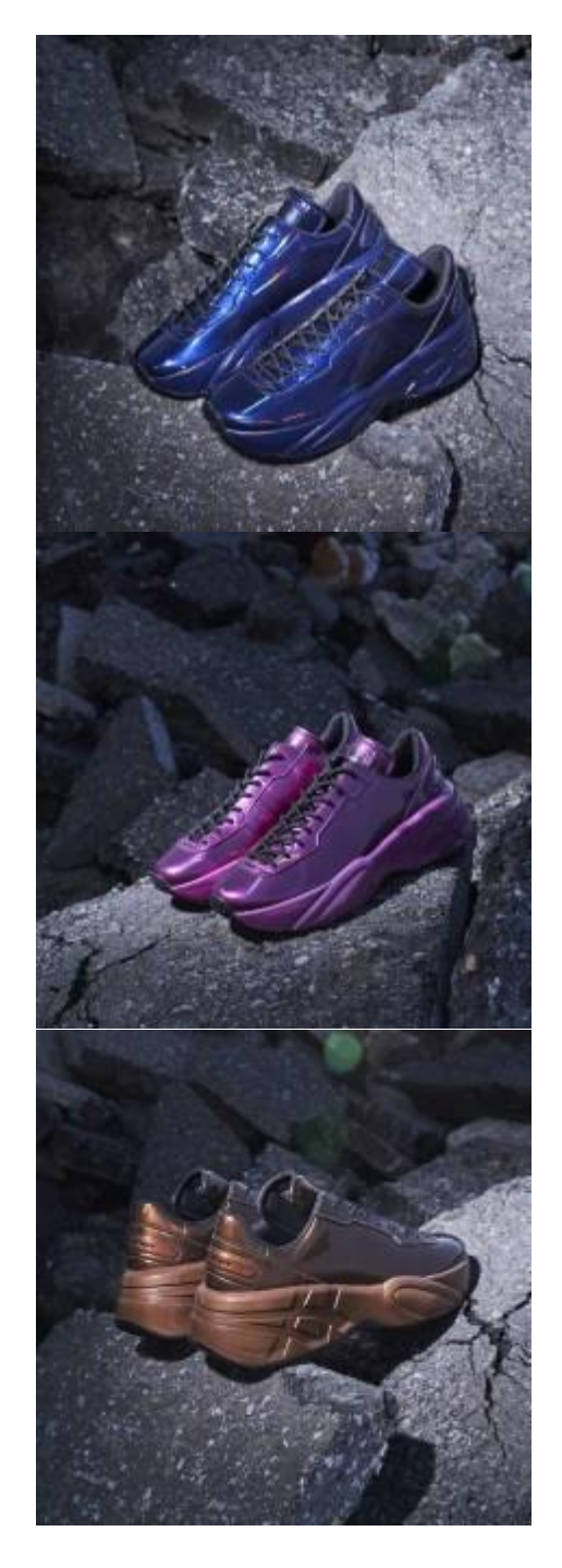
The P-TRAINER PRZM retails at RM739.